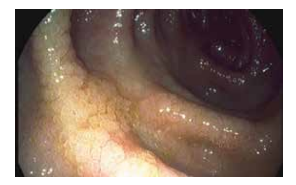
Figure 1. An endoscopic example of serrated epithelial change during high-definition endoscopy.