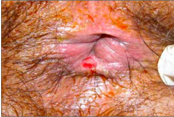
Figure 2. An acute anal fissure with the appearance of a fresh laceration.

sphincter muscles and resected. Although hemorrhoido- pexy has been associated with less postoperative pain than hemorrhoidectomy, some studies have shown a slightly higher risk of recurrence. 10-12