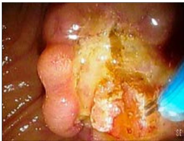
Figure 4. Needle knife incision of a chronically inflamed bile duct to provide access for stone removal.

If the duodenal papilla cannot be identified in a patient with otherwise normal local anatomy, it may be hiding within or in the vicinity of a duodenal diverticulum. Careful inspection of diverticula on the medial wall of the descending duodenum will usually reveal the missing papilla. Cannulating it may present yet another difficulty if the presence of the diverticulum has distorted the axis of the desired duct(s).