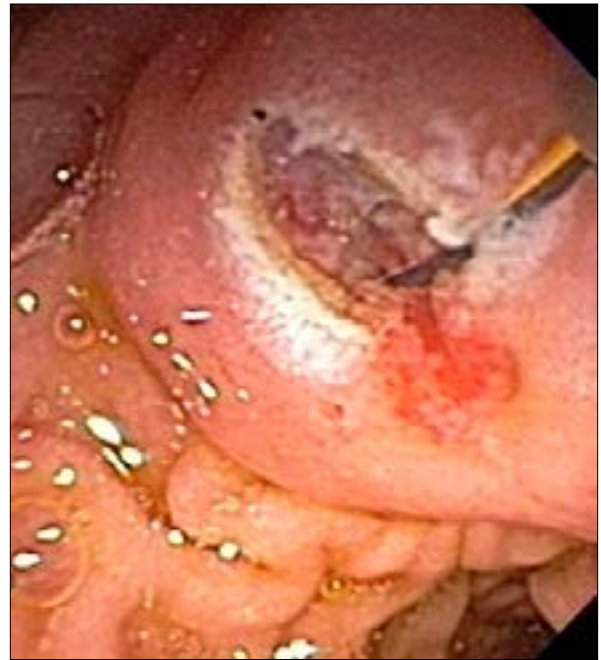
Figure 3. Minor duodenal papillotomy performed over a guidewire.

JB Pregnancy was once considered an absolute contraindication to ERCP; endoscopists feared that a complication such as pancreatitis or bleeding could harm the fetus as well as the mother. However, since the first case series of successful, uncomplicated ERCP in pregnancy was published by my colleagues and I in 1990, there has not been a single report of maternal or fetal mortality in this setting. Nevertheless, the use of ionizing radiation must be kept to a minimum when performing ERCP on preg-