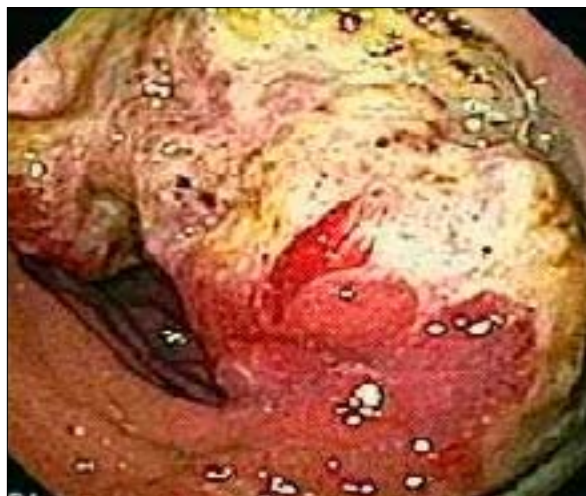
Figure 1. A duodenal tumor obstructing access to the main duodenal papilla for endoscopic retrograde cholangiopancreatography.

JB With the explosion of obesity in the United States, body habitus must be considered when evaluating patients for ERCP. Morbidly obese persons are harder to sedate with standard intravenous agents (moderate sedation), more likely to suffer from sleep apnea, and more difficult to resuscitate in an emergency. Increasingly, ERCP is being performed under monitored anesthesia care or full general anesthesia, and this is especially important in obese patients. The standard semiprone (almost face-down) position typically used for ERCP adds to the difficulty of accessing the airway in the event of respiratory depression or arrest in these patients. For this reason, anesthesia providers may request that the procedure be performed in the supine position, which is technically more demanding. Patients under anesthesia are usually immobilized by tape or straps attached to the fluoroscopy table, making subsequent repositioning