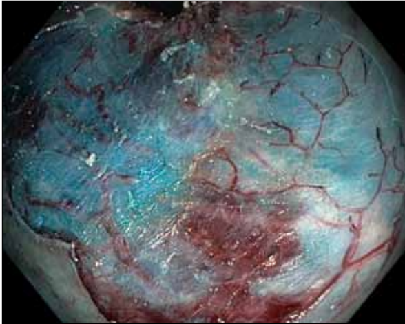
Figure 1. A large distal rectal postresection mucosal defect. Numerous vessels are visible ramifying within the submucosal plane. Despite the number of vessels, the postprocedural bleeding risk in this case is low, given the rectal location.