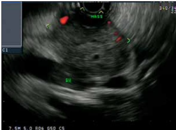
Figure 1. An endoscopic ultrasound image showing a hypervascular mass in the tail of the pancreas invading the splenic vein (SV).