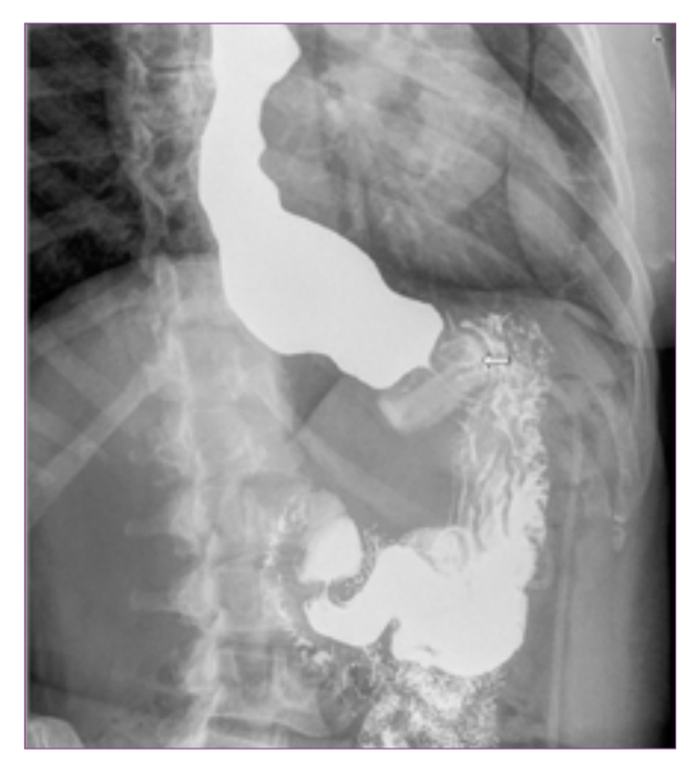
Figure 1. A dilated esophagus channeling through to the gastric region, with absent peristalsis, is shown. The arrow indicates the gastric band.

Pseudoachalasia is often indistinguishable from achalasia on barium studies and esophageal manometry. In pseudoachalasia, a clinician may find a rigid cardia or fail to pass the endoscope into the stomach. Failure to respond to calcium channel blockers, pneumatic dilation, or surgery is common. As in this case, the ability to distinguish between achalasia and pseudoachalasia often occurs after removal of a laparoscopic band.<sup>6,7</sup>